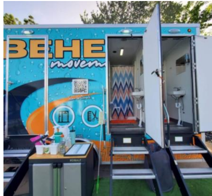
MOBILE BARBERSHOP BUS